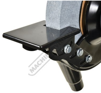
Tool Rest Dust Chute