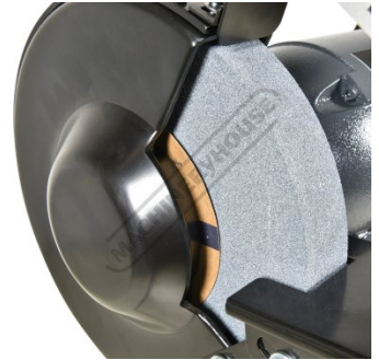
Fine Grinding Wheel