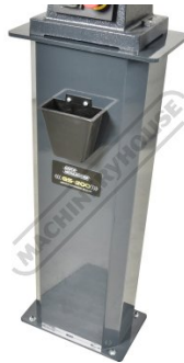
Optional Bench Grinder Stand - G182