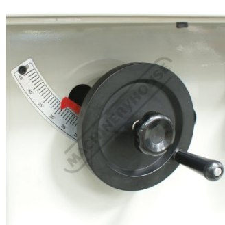
Blade Height Adjustment Handle and Angle Scale