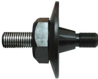
KA1028 ARBOR EXTENSION