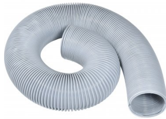
W3981 3 Metre PVC Dust Hose