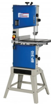
W952 Wood Band Saw