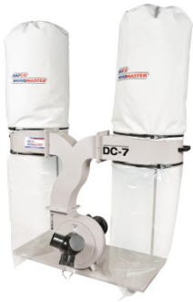
W329 Dust Collector