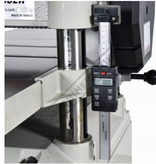
Digital Height Readout