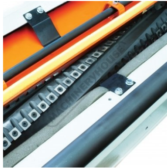
4 x Spiral Cutter Head with Carbide Inserts