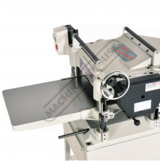
Cast Iron Feed Table