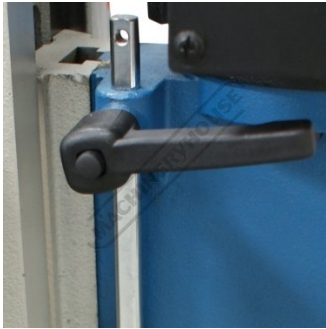
Adjustable Depth Stop