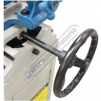
Cross Slide and Table Travel Handwheel