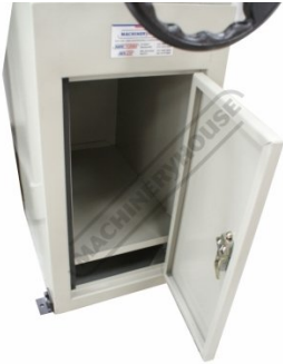
Large Storage Cabinet