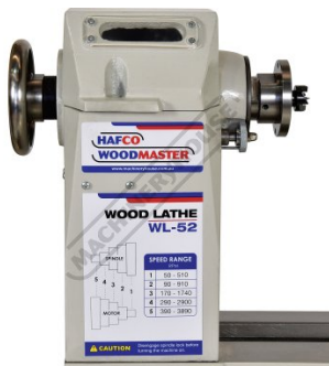
Visible Check Speed Selection