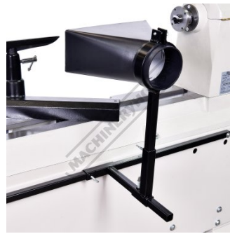
Dust Hood Attachment Close Up