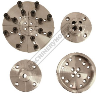
W375 WSC KIT Scroll Chuck Accessory Kit