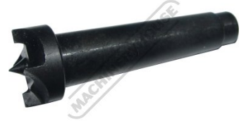
WC023 Drive Centre 2MT