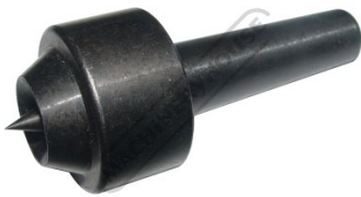
WC037 61 Live Centre 2MT