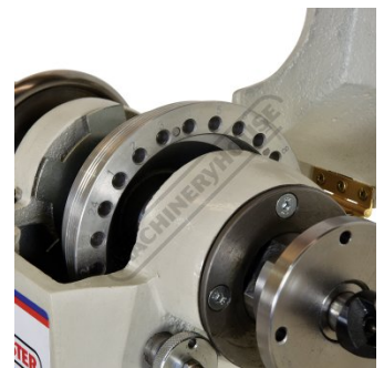
24 Position Indexing