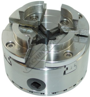
W370 WSC 100 Scroll Chuck