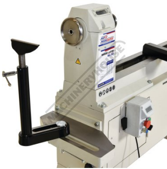
Bowl Turning Attachment