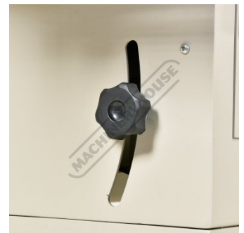
Motor Belt Tension Handle