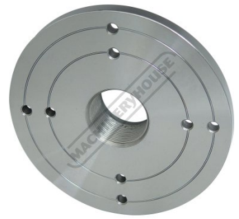
W298 FP 150 Face Plate 150mm