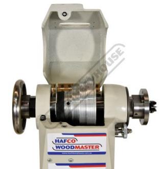
Flip Up Guard for Quick Belt Speed Change