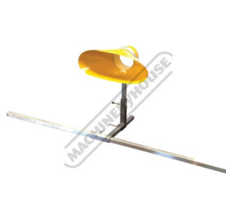
W290D Dust Chute with Adjustable Brackets 100mm