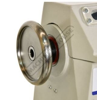
Spindle Hand Brake Wheel