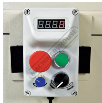
Variabe Spindle Speed Dial with Digital Readout Display