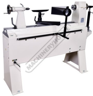
Dust Chute Attachment