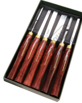
W3036 CHS6P HSS Turning Tool Set