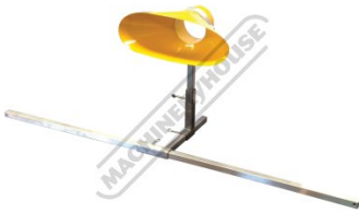
W290D Dust Chute with Adjustable Brackets 100mm