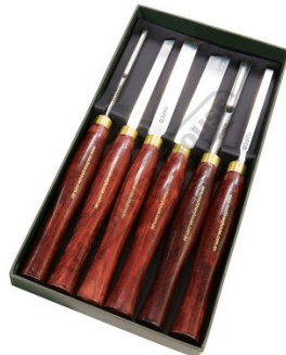
W3036 CHS6P HSS Turning Tool Set