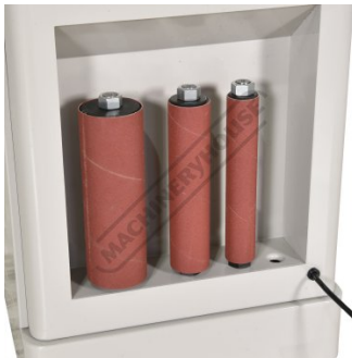
Sanding Spindle Holders on Left Side