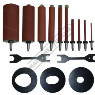
Sanding Spindles Table Inserts and Spanners