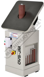
Tilt Table to 45 Degrees