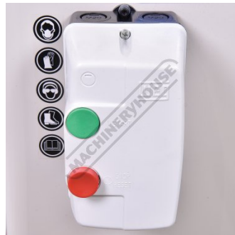
Start Stop Switch