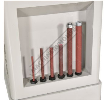
Sanding Spindle Holders on Right Side