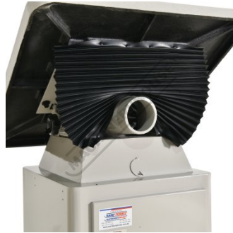
100mm Dust Extraction