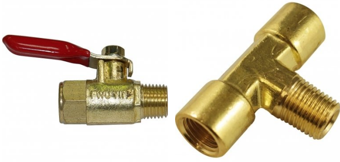
F880 Air Fittings