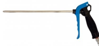
A251 Hi Flow Air Duster Gun