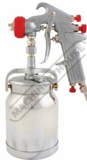
S325 Suction Spray Gun & Pot