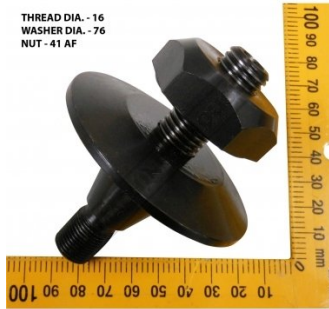
KA1028 ARB NUT FLG DADO 1028 952 953