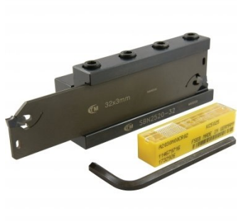
L467 Professional Lathe Parting Tool Kit - Insert Type