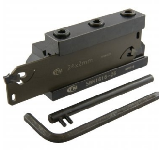
L465 Professional Lathe Parting Tool Kit - Insert Type