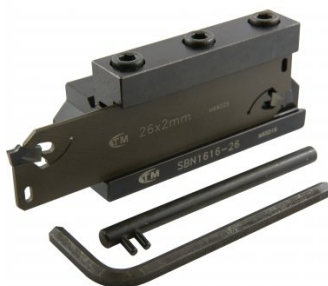
L466 Professional Lathe Parting Tool Kit - Insert Type