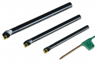
L430 Boring Bar Set - Carbide Insert