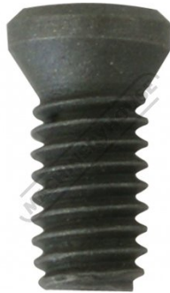
L525 Screw to Suit Turning Tool Holder