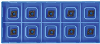
L060 KYOCERA Carbide Inserts - Turning