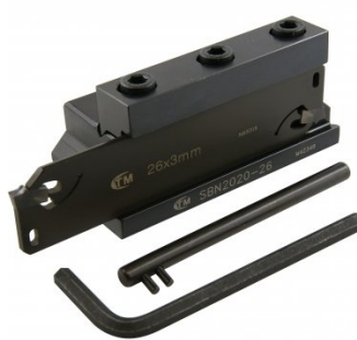
L467 Professional Lathe Parting Tool Kit - Insert Type