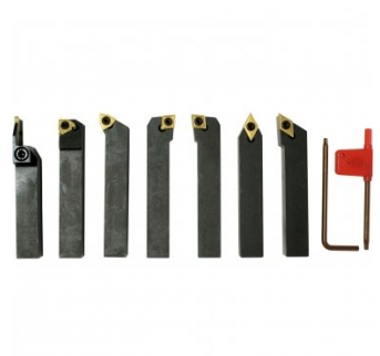
L0077 Lathe Turning Tool Kit - 7 piece Insert Type