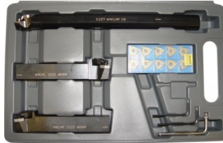
L453 Lathe Turning Tool Kit - 3 piece Insert Type