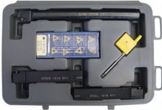
L452 Lathe Turning Tool Kit - 3 piece Insert Type