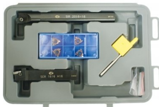
L457 Lathe Threading Tool Kit - Insert Type