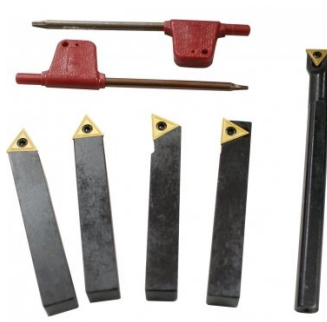
L0055 Lathe Turning Tool Kit - 5 piece Insert Type