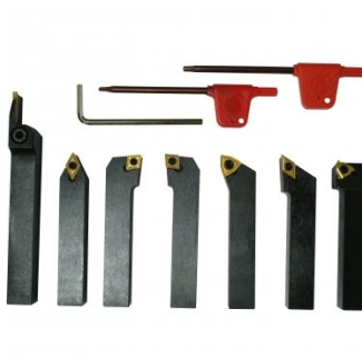
L0077 Lathe Turning Tool Kit - 7 piece Insert Type