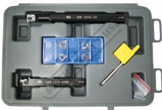
L457 Lathe Threading Tool Kit - Insert Type