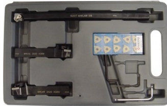
L452 Lathe Turning Tool Kit - 3 piece Insert Type