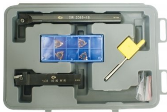
L458 Lathe Threading Tool Kit - Insert Type