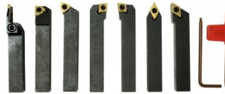
L0077 Lathe Turning Tool Kit - 7 piece Insert Type