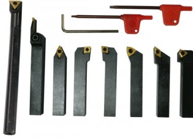
L0099 Lathe Turning Tool Kit - 7 piece Insert Type