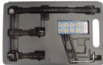
L452 Lathe Turning Tool Kit - 3 piece Insert Type