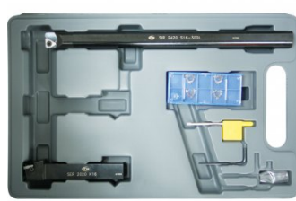
L458 Lathe Threading Tool Kit - Insert Type