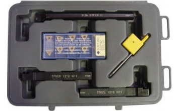
L450 Lathe Turning Tool Kit - 3 piece Insert Type