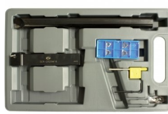
L459 Lathe Threading Tool Kit - Insert Type