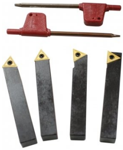
L0055 Lathe Turning Tool Kit - 5 piece Insert Type