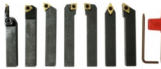
L0077 Lathe Turning Tool Kit - 7 piece Insert Type