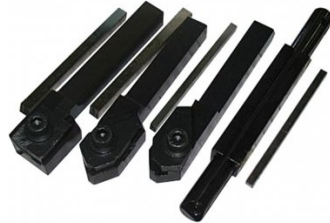
L0085 Carbide Turning Tool Set - 11 piece