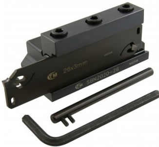
L466 Professional Lathe Parting Tool Kit - Insert Type