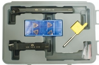
L458 Lathe Threading Tool Kit - Insert Type