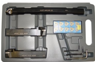
L456 Lathe Threading Tool Kit - Insert Type