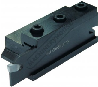
Shown Setup with Optional Blade and Tip