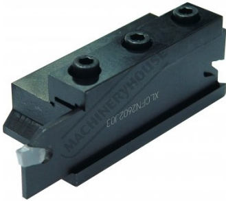
Shown Setup with Optional Blade and Tip