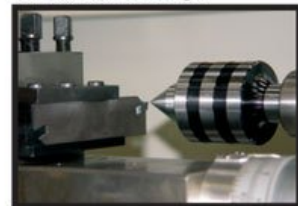
Correct Centre Height

For the tool to cut correctly it needs to be set on centre. This can be best achieved by placing a centre in the tailstock and adjusting the tool height to line up with centre point.