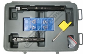
L456 Lathe Threading Tool Kit - Insert Type