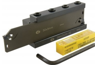
L467 Professional Lathe Parting Tool Kit - Insert Type