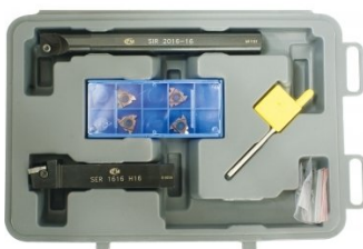
L458 Lathe Threading Tool Kit - Insert Type