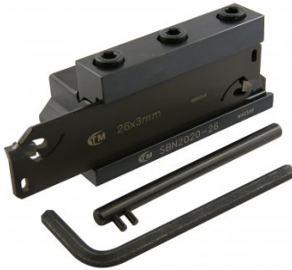
L466 Professional Lathe Parting Tool Kit - Insert Type