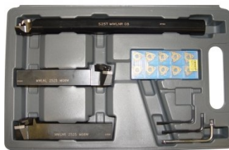
L464 Professional Lathe Parting Tool Kit - Insert Type