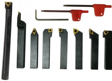
L0077 Lathe Turning Tool Kit - 7 piece Insert Type