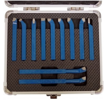
L0085 Carbide Turning Tool Set - 11 piece