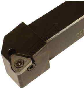
Toolholder Close Up