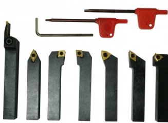
L0077 Lathe Turning Tool Kit - 7 piece Insert Type