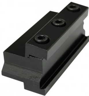
L029 Parting Block - Suits 26mm Blade