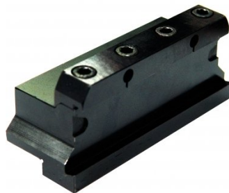
L029B Parting Block - Suits 32mm Blade