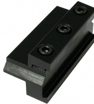
L027 Parting Block - Suits 26mm Blade