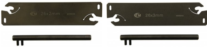
L469 Parting Blade