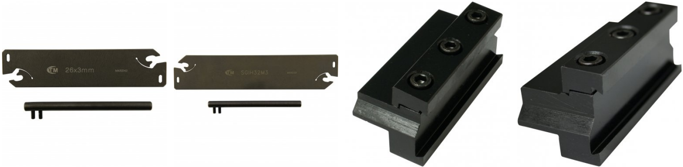
L029 Parting Block - Suits 26mm Blade