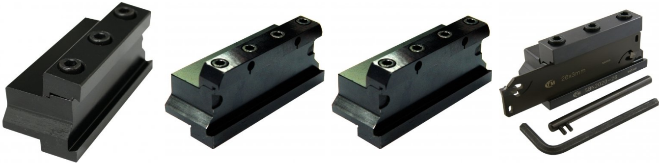
L466 Professional Lathe Parting Tool Kit - Insert Type