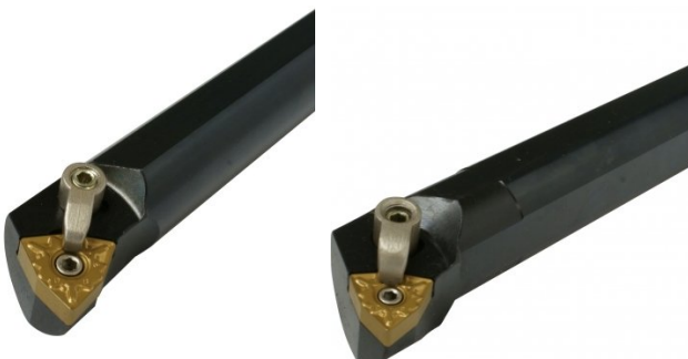
L416 Right Hand Boring Bar