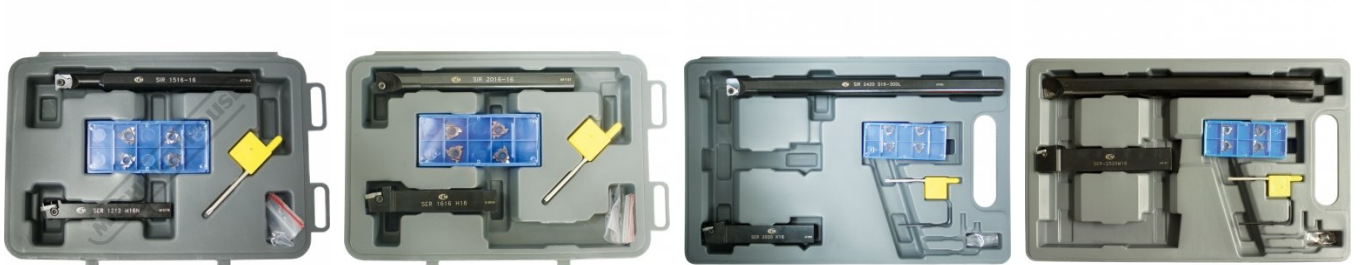
L459 Lathe Threading Tool Kit - Insert Type