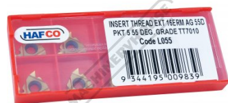
5 Piece Pack