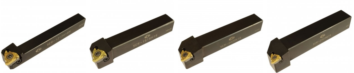
L456 Lathe Threading Tool Kit - Insert Type