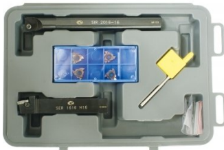
L457 Lathe Threading Tool Kit - Insert Type