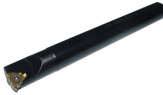
L038 Internal Threading