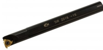
L037 Internal Threading