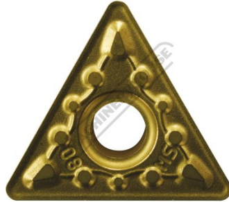
Tip Top View