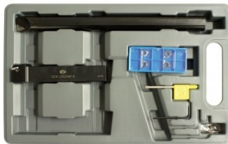
L464 Professional Lathe Parting Tool Kit - Insert Type