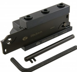
L466 Professional Lathe Parting Tool Kit - Insert Type