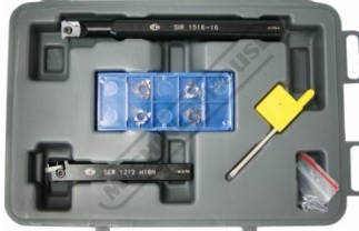
L457 Lathe Threading Tool Kit - Insert Type