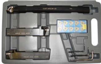
L456 Lathe Threading Tool Kit - Insert Type