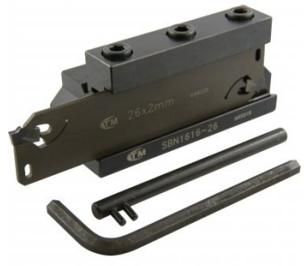
L465 Professional Lathe Parting Tool Kit - Insert Type