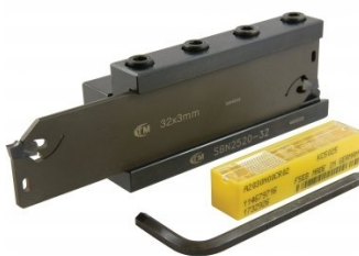
L467 Professional Lathe Parting Tool Kit - Insert Type