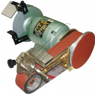
Shown mounted on a Optional Bench Grinder