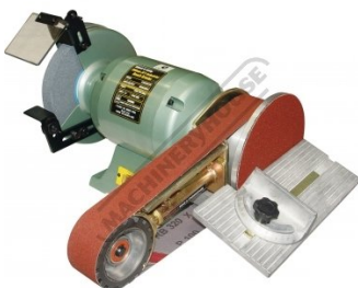
Shown Fitted to a Optional Bench Grinder