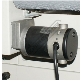
Table Feed Motor