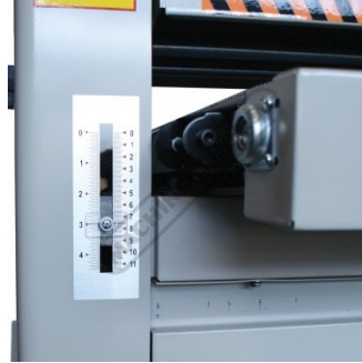
Table Height Gauge