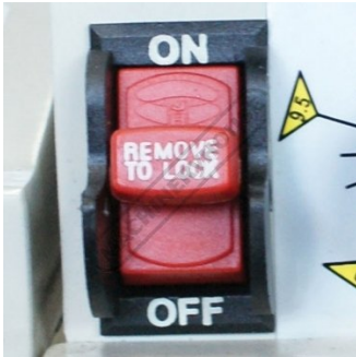
Safety Interlock Switch