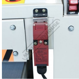
Lid Safety Interlock Switch