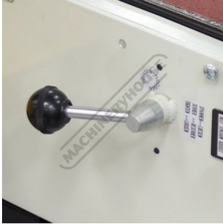
Belt Tension Lever