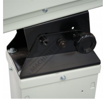
Head Tilt Adjustment