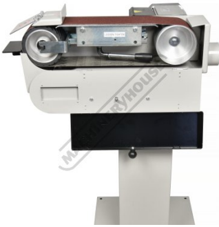
Quick Release Belt Replacement