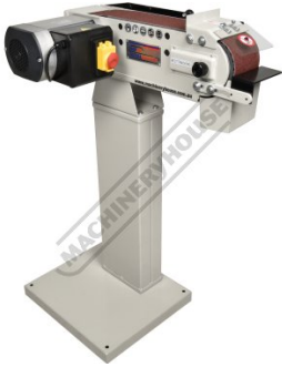
Shown With Top Lid Open