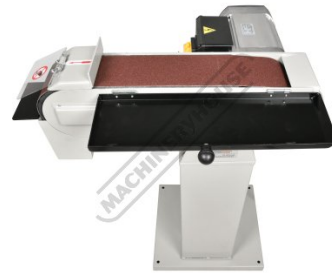
Side View With Lid Open