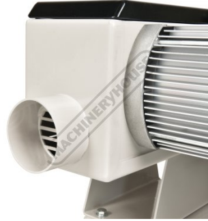
Rear Dust Chute