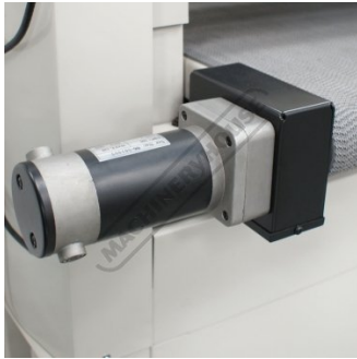
Conveyor Feed Motor