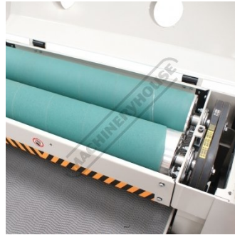
Twin Drum Sanding System