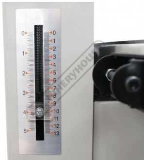
Thickness Height Gauge