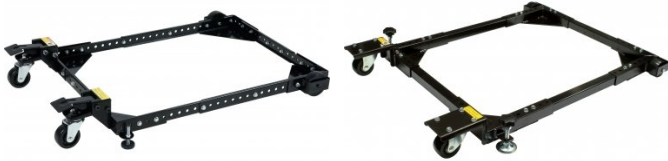
W931 Mobile Base - Heavy Duty