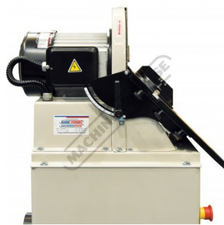
Table Tilted At 45 Degrees