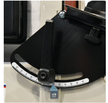
Table Tilted Locking Handle And Scale