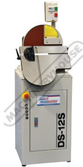
Table Shown Tilted