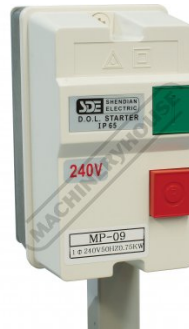
ON OFF Switch