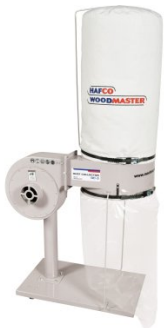
W332 Dust Collector