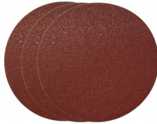
A5405 120G x 380mm (15") Aluminium Oxide Sanding Disc Pack