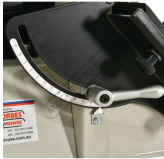
Table Tilt Scale