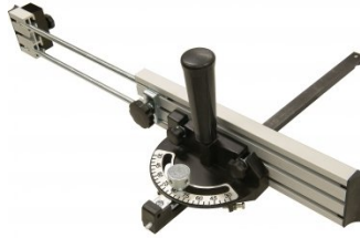
W308 Mitre Gauge & Fence