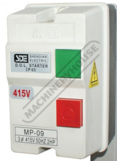
ON OFF Switch