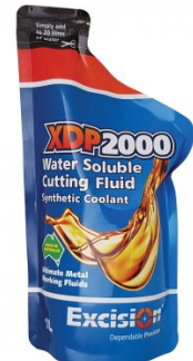
S090A Soluble Metal Cutting Fluid - 1 Litre