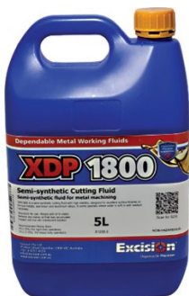
S090 Soluble Metal Cutting Fluid - 5 Litre