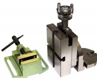
L277 Vertical Mill Slide