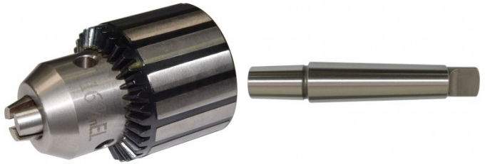
D443A 3MT x JT3 Drill Chuck Arbor