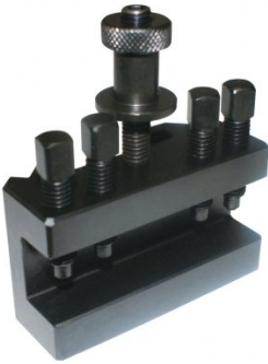
L295A Quick Change Toolpost Holder - Std