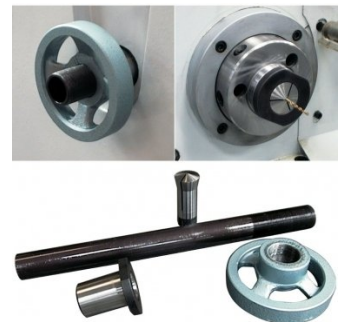
C980 5C Collet Lathe Adaptor