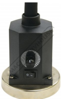
Brightness Dimmer Control