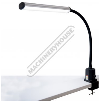
Shown with Lamp Attached