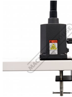
Clamped To Table - Side View