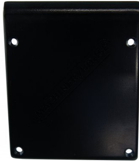
Top Plate, 60 x 60mm Centres