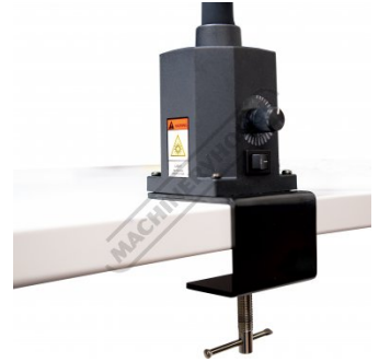
Clamped To Table - Front View