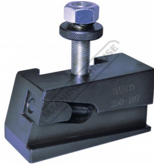
Shown as in Box