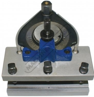
Quick Change Toolpost