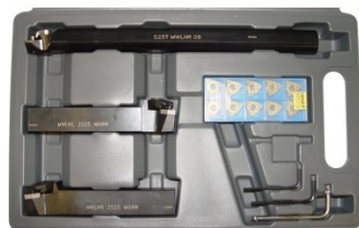
L453 Lathe Turning Tool Kit - 3 piece Insert Type