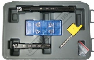
L456 Lathe Threading Tool Kit - Insert Type