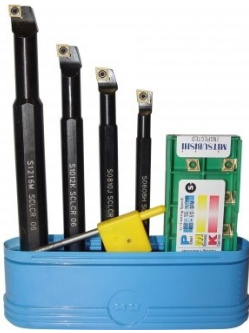
L072 HSS Turning Tool Set - 4 piece