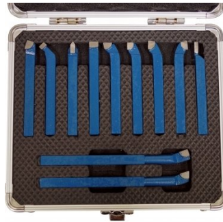
L0085 Carbide Turning Tool Set - 11 piece