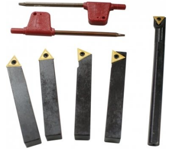
L0055 Lathe Turning Tool Kit - 5 piece Insert Type