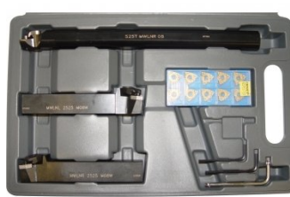
L453 Lathe Turning Tool Kit - 3 piece Insert Type