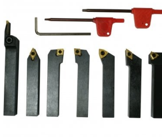
L0099 Lathe Turning Tool Kit - 7 piece Insert Type