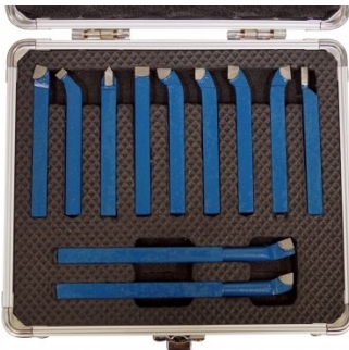
L0085 Carbide Turning Tool Set - 11 piece