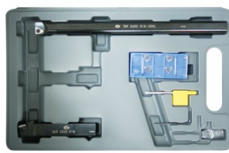
L459 Lathe Threading Tool Kit - Insert Type