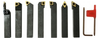
L0077 Lathe Turning Tool Kit - 7 piece Insert Type