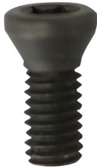
L539A Screw to Suit Threading Tool Holders