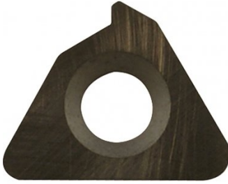
L537A Seat to Suit Internal Threading Tool Holders